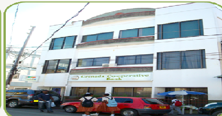
Grenville, St. Andrews