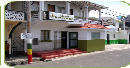
Sauteurs, St. Patricks