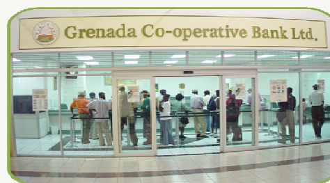
Spiceland Mall, Grand Anse