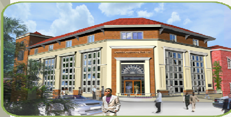
Church Street, St. Georges

Co-op Bank is licensed under the Banking Act of 2005 and is consistent in meeting the requirements of the Eastern Caribbean Central Bank (ECCB).